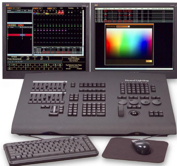
92811 Palette VL, 16 submaster console

Oh, and you can even read your existing Strand 300 and 500 series console show files, bringing new life to your repertory of productions.