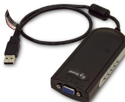
A second video display is available using our new plug in USB video module.