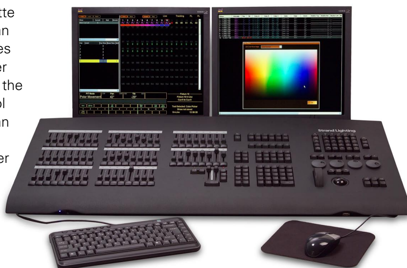
92814 Palette VL, 64 submaster console

There's so much that's new with Palette VL. And so much that you already know. The Palette VL family of consoles bridge between the clean simple operation of our regular Palette consoles with the control and sophistication of our larger Light Palette VL consoles. Now you can have the power of conventional and moving light control in a value priced system. Palette VL features an integral trackball, moving light encoders and direct action attribute keys to extend the power of the Palette family of consoles. Available with 500 to 1500 channels, the new consoles now offer an optional second video display to present more information to console operators, including an advanced moving light control screen.